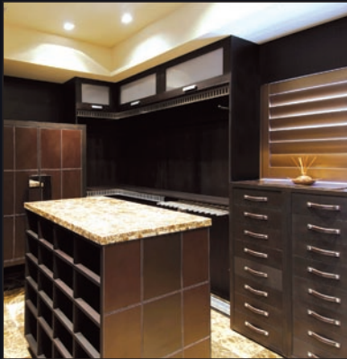
Residential / Closet