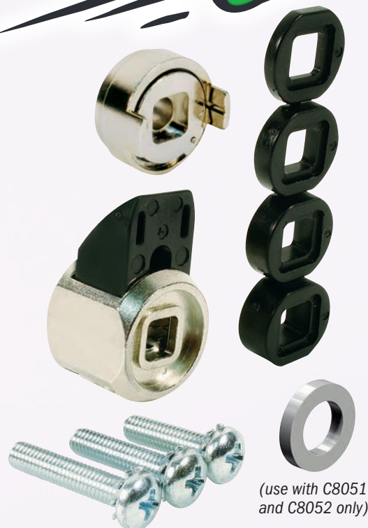
(use with C8051 and C8052 only)