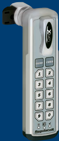
RegulatorR with self-locking

Electronic push button cabinet locks can be installed easily on new or retrofit applications.