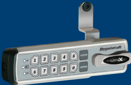
RegulatorR with manual locking